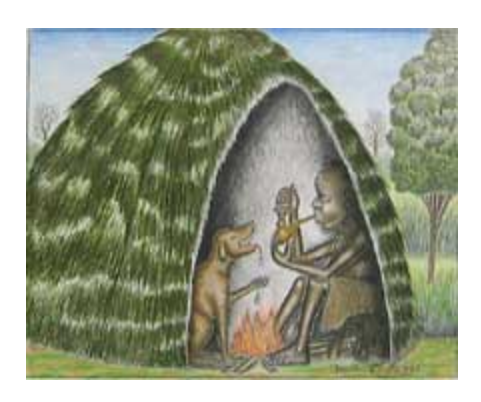
Artwork by George Monyaru at Nakuru National Theater.