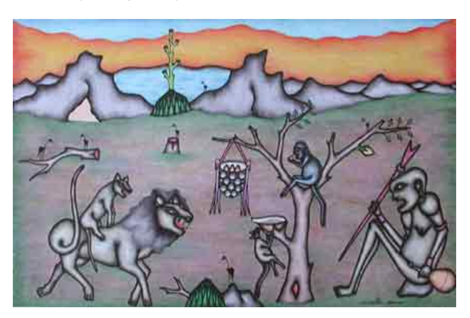
Artwork by Peter Ngugi Njuguna, 2006 at Nakuru National Theater.