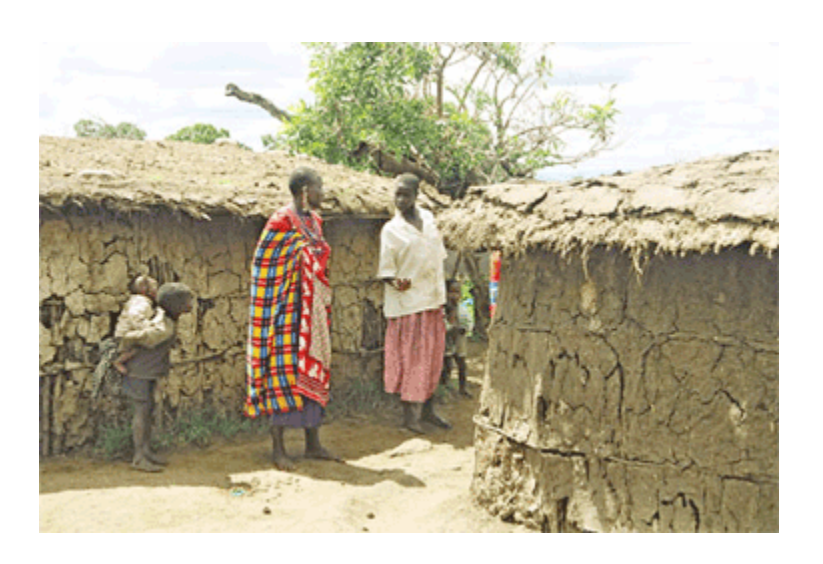
The Maasai culture is artistic by nature. How they preserve their culture and identity is an art, too.